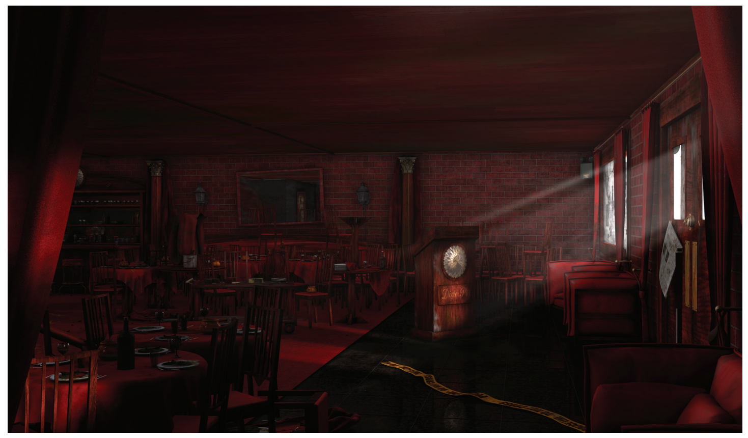
Reaching into their minds: With over 13,000 objects and a staggering 9,000,000 polygons, the Dixie Pig appeared exactly as many fans had imagined.

changed everything for us. It has a CineBench mark of over 30,000! Coupled with Cinema 4D's amazingly fast, high-quality render, we're seeing things now that we would have thought were many years off."