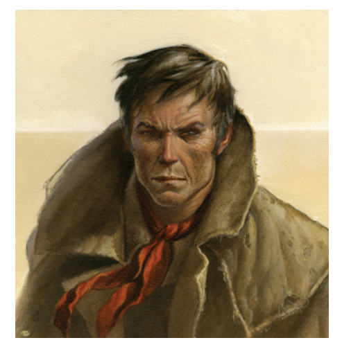
Gunslinger Roland Deschain as envisioned by artist Michael Whelan.

range of hardware configurations and, as Petit puts it. "what life would be like under each choice." Stark considered the options and then selected a 3DBOXX 8500, the top of the BOXX workstation line, featuring dual guad-core Intel® Xeon<sup>®</sup> processors. He also opted for a custom configuration he believed would best suit the workflow demands of both Discordia and stephenking.com. Stark's confidence in BOXX was buoyed by the fact that all possible BOXX configurations have been pre-tested by BOXXlabs before they are ever chosen by customers. "Everyone at BOXX dealt with us on a level that I would describe as "boutique," says Stark. "This is a good thing when you're talking about fine computers."